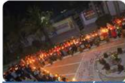
भारत माता पूजन कार्यक्रम